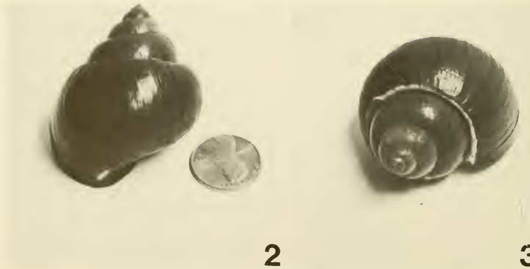
Figs. 2-3. Representative specimens of Ampullaria cuprina (Mystery snail).